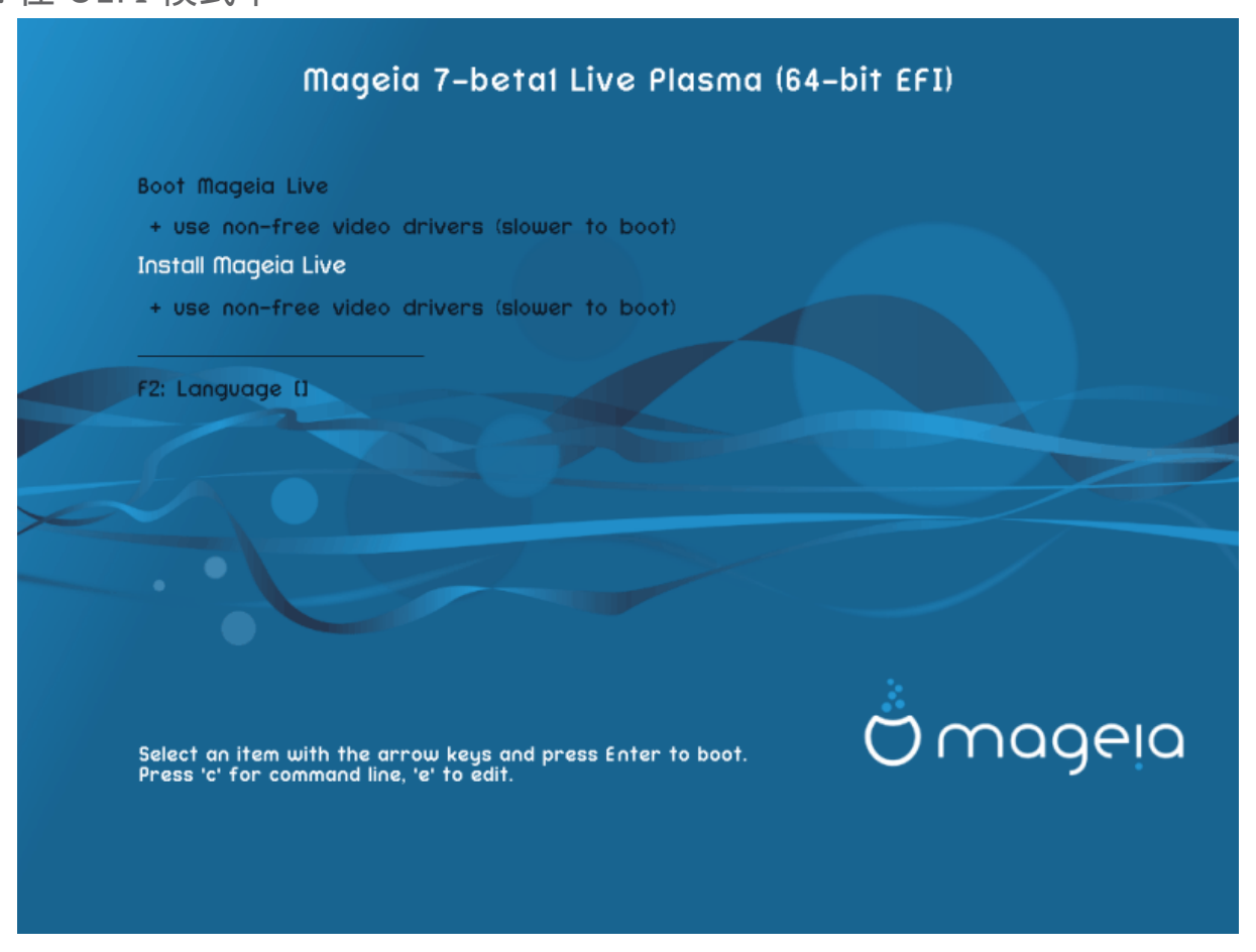
First screen while booting in UEFI mode